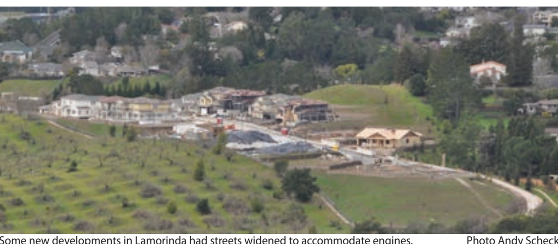
Some new developments in Lamorinda had streets widened to accommodate engines.